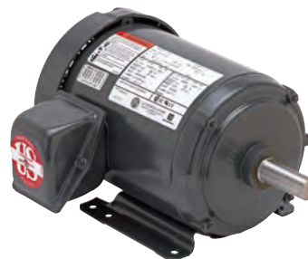
UNIMOUNT® Motors Footed