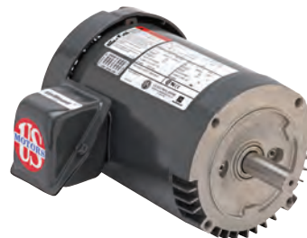
UNIMOUNT® Motors C-Face Footless