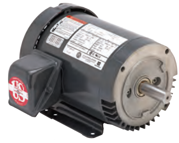
UNIMOUNT® Motors C-Face Footed